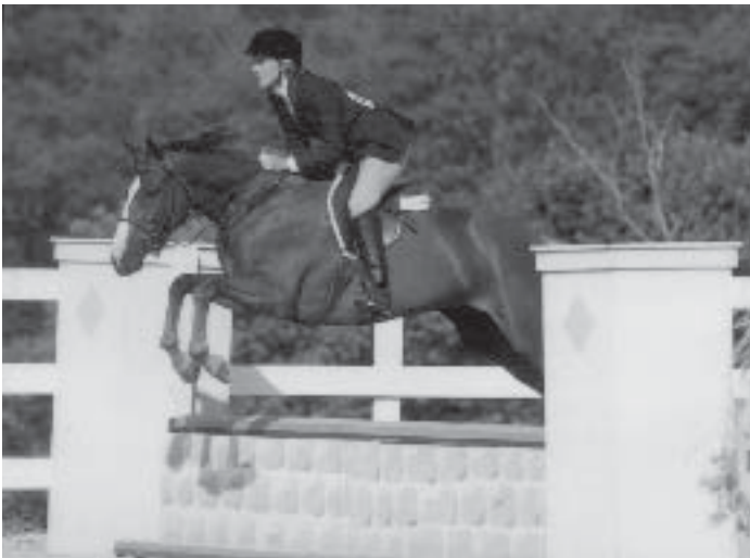
LOT 21 - DESTINYS GIRL