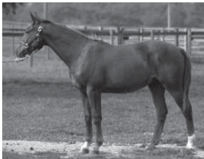
LOT 5 - BELISARI VT

Despite his large size, Crown Royal VT is an easy-going young gelding perfectly suited for the youth or amateur owner as a hunter or dressage prospect. Sire Concerto Grosso is a successful hunter and has been recognized by ISR/Oldenburg NA for his ability to sire a high number of Premium foals. Damsire Nebelwerfer also sired the Grand Prix dressage stallion and hunter champion Nebelhorn , who stood at Virginia Tech for many years. Crown Royal is the eighth foal produced by his mother for our program, and each of her foals has had the same laid-back temperament, athletic build and elastic way of going.