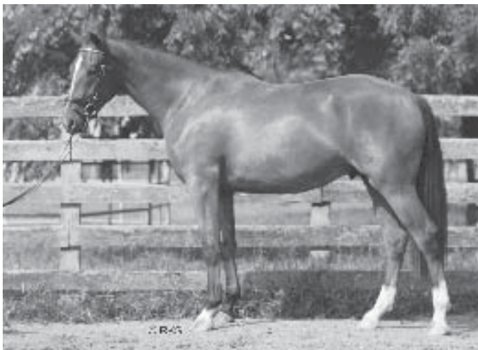
LOT 9 - NOBLE OATH VT