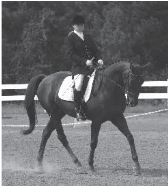
LOT 27 - SPYDER

Oliver is a talented hunter who has shown in the 3' Adult division. He has been ridden as part of the Virginia Tech equitation and lesson program for three years. Oliver jumps well and has automatic changes, but requires a confident intermediate to advanced rider. Look for Oliver to be presented under saddle on sale day!