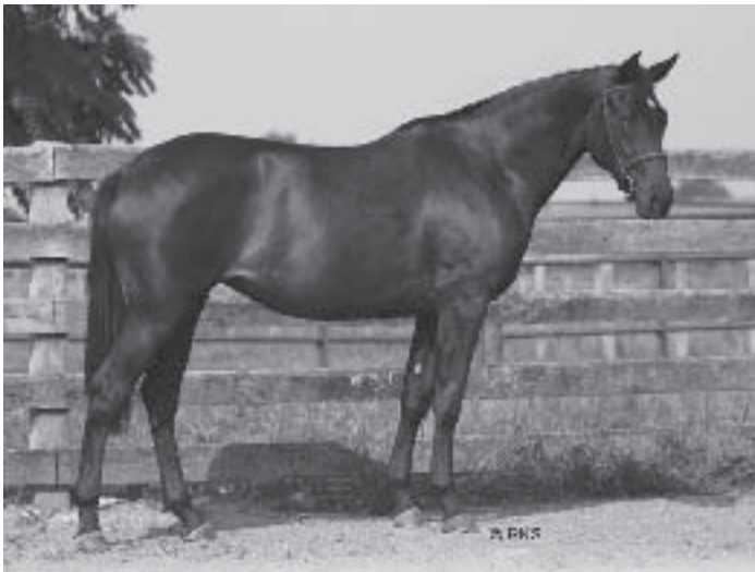
LOT 12 - ATHENA VT