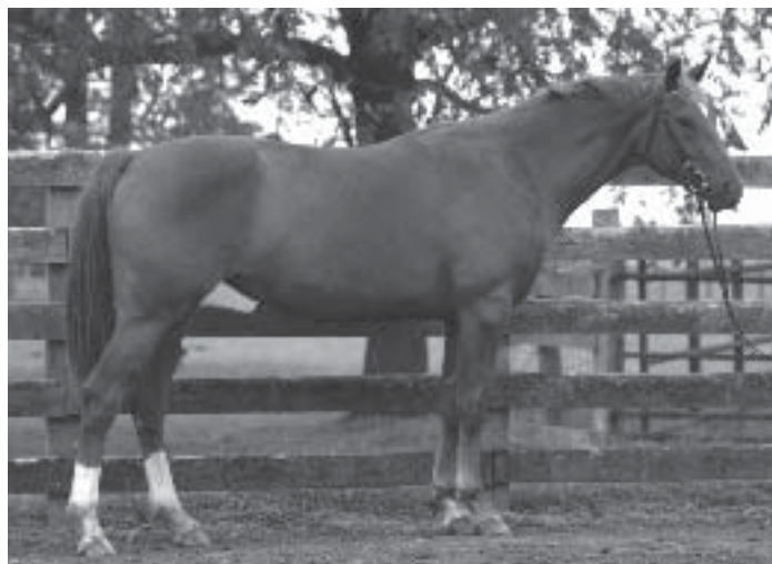
LOT 11 - ODESSA VT