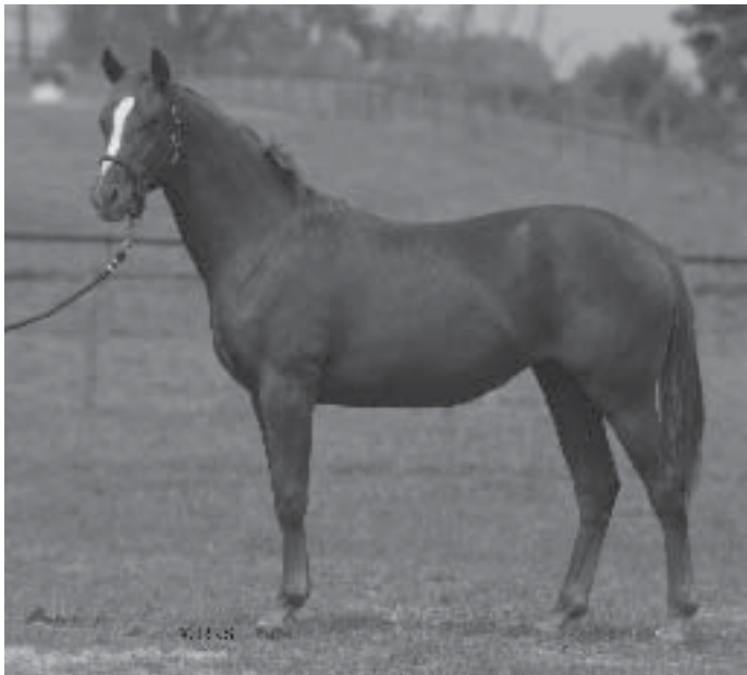
LOT 8 - BIANCA VT

Bentley VT is an elegant yearling hunter prospect suitable for the youth or amateur rider. He is personable and eager to please, and has been handled extensively since birth. His sire, Baladin d'Oc , competed successfully at dressage and is from a family of very talented jumpers. Bentley's dam, the Thoroughbred mare Triple Beat , descends from the Raise A Native line, well-known for its ability to produce successful sporthorses. Bentley is branded Oldenburg NA, and is also eligible for double registration as an Anglo-Arabian with the Arabian Horse Association.